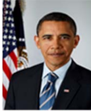
Barack Obama (Democratic Party)

Comments: While President Obama has repeatedly expressed support for American-Muslims, he has also often sought to distance himself from the community. Mr. Obama has pledged to ban racial profiling although racial and religious profiling have not decreased under his administration. On immigration, Mr. Obama signed an executive order earlier this year granting deportation waivers for “DREAMers,” although his administration deported over 1.1 million undocumented immigrants, more than any other president since the 1950s. On human rights, although Mr. Obama ended the usage of torture and extraordinary rendition, he also signed the NDAA, which authorized the extra-judicial assassination of U.S. Citizens, and failed to close the Guantanamo Bay detention camp (though this was due to Congressional opposition). He signed into law every reauthorization and extension of the PATRIOT Act. Finally, although he has often taken a more peaceful, diplomatic approach to foreign relations than President Bush, he has also greatly expanded the usage of unmanned drones in foreign nations.