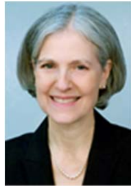
Jill Stein (Green Party)