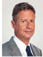
Gary Johnson (Libertarian Party)

Comments: As a libertarian, Johnson generally supports limited government, arguing that government should not interfere too much in the citizens' lives or in foreign affairs. He generally supports civil rights protections, and has explicitly come out against the TSA's racial profiling. On immigration, Johnson believes the overall immigration process should be streamlined to make it easier for people to get work visas. He supports the DREAM Act and a "two year grace period" where undocumented immigrants can obtain work visas. On human rights, he opposes torture and indefinite detention, arguing that the government must respect habeas corpus. He supports waging war for humanitarian reasons, and said, "We should resort to military action as the last option and only as provided in the Constitution." He has criticized drone strikes. He said he wishes to, "Leave all options on the table." He opposes the death penalty, the Patriot Act, and SOPA. On labor, he opposes child labor laws, supports right-to-work laws, and, while Governor, vetoed a bill to raise the minimum wage.