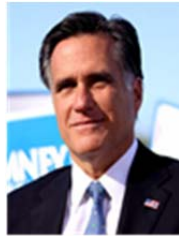
Mitt Romney (Republican Party)