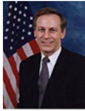
Virgil Goode (Constitution Party)